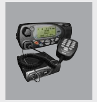
Remote head configuration