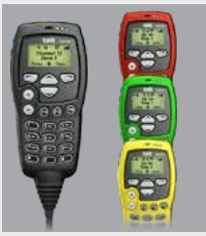
Hand-held control head (HHCH)