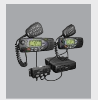
Dual head configuration