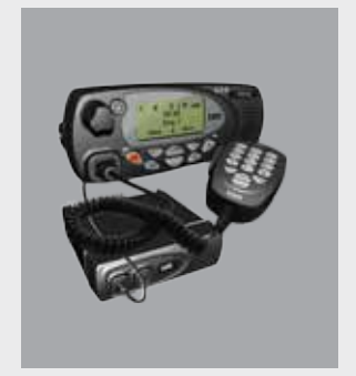
Remote head configuration