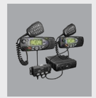
Dual head configuration