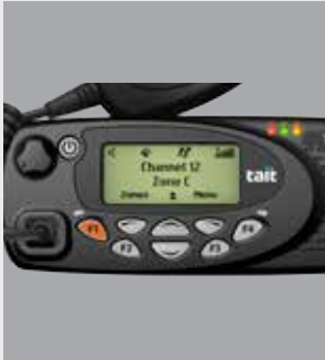
Standard control head